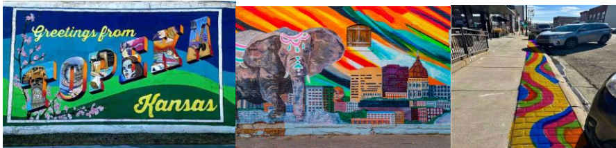
From left to right: the iconic Topeka Mural, the vibrant elephant mural at the corner of Laurent and Gordon, and our new sidewalk art initiative set to brighten the 800–900 blocks of Kansas Avenue.

But we're not stopping there. We have ambitious plans for new public art installations designed to draw even more people to Topeka. These enhancements are part of our broader strategy to double down on the arts and solidify our role as a thriving, nationally recognized arts district. By investing in both preservation and innovation, we aim to create a place where creativity leads to economic and community development.